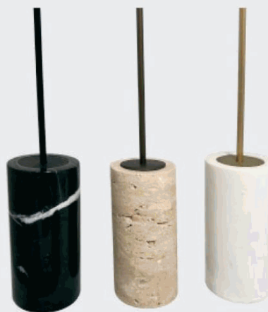
Marble - Black, Travertine & White

Light on Landscape strongly recommend that all luminaires be correctly installed and maintained. Failure to do so will result in the voiding of the manufacturer's warranty and the reduced efficiency, performance and life of the fixture. To eliminate voltage drop, we advise that the recommended UV stabilized cable and run lengths are used, along with soldered joins, heat shrink connectors and quality lamps.