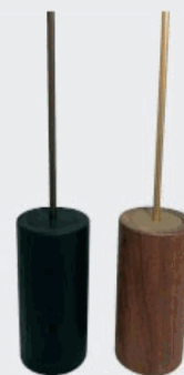
Timber - Black Oak & Walnut