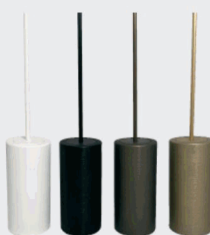
Machined Bronze - White, Black, Dark Bronze & Champagne