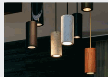
In situ - combinations of fittings and rods