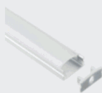
Extrusion & Diffuser - Low Profile