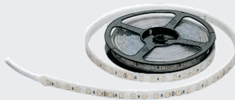
LED Tape - 5 metre Roll