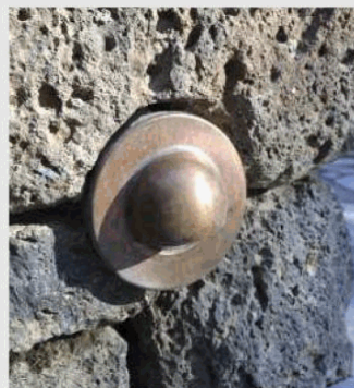
Copper after exposure to weather