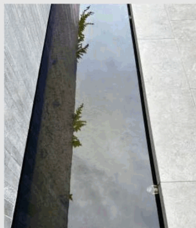
In situ stainless steel - no base