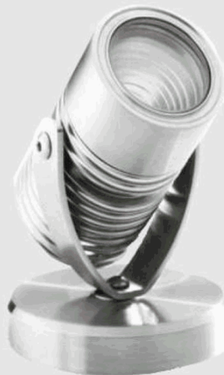
Type 3 stainless steel - with base

Light on Landscape strongly recommend that all luminaires be correctly installed and maintained. Failure to do so will result in the voiding of the manufacturer's warranty and the reduced efficiency, performance and life of the fixture. To eliminate voltage drop, we advise that the recommended UV stabilized cable and run lengths are used, along with soldered joins, heat shrink connectors and quality lamps.